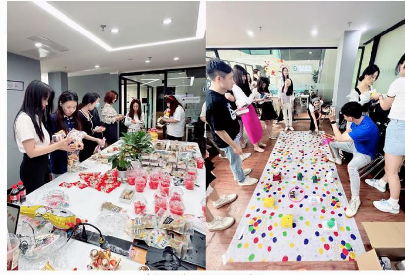
Interactive game session

To make the event even more memorable, an interactive game session was organized, bringing out the competitive spirit and team-building skills among the employees. These engaging activities created an environment of laughter, friendly competition, and shared memories. Colleagues competed, collaborated, and enjoyed friendly challenges, creating an atmosphere of joy and celebration.