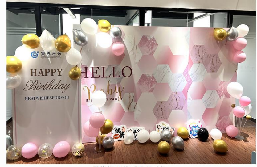
Birthday party sign-in wall

On June 29th, GEC Academy organized a regular employee birthday party dedicated to celebrating the birthdays of all employees in the Beijing office. At GEC, we value every individual since GECers are at the core of GEC Academy, so continuously improving every GECer's happiness is a steadfast pursuit for us. As part of this commitment, we regularly organize carefully curated birthday parties for our employees. The birthday parties encouraged everyone to come together, enjoy delicious treats, and bond over exciting activities.