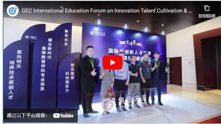
Click HERE to watch the highlights at the forum on YouTube

In a momentous event held on June 30th, the International Education Forum on Innovation Talent Cultivation and Global Competence Development took center stage in Beijing. Organized by GEC Academy in collaboration with the Beijing Education Association for International Exchange, the forum brought together an impressive lineup of educational leaders and experts. With strong collaborative support from GEC Academy and SJTU - GEC Center of Innovative Design for Interdisciplinary Studies, and Oxford AQA, this gathering of minds aimed to explore and deepen the understanding of crucial educational themes.