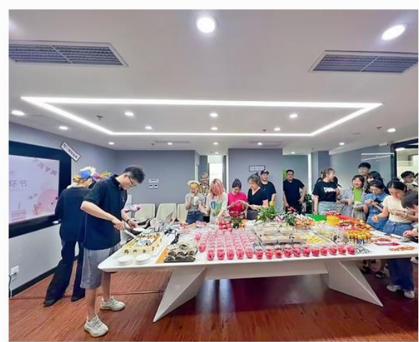
Cutting and sharing the birthday cake

The highlight of the birthday celebration was the surprise cake-cutting ceremony, where employees gathered around the beautifully decorated cake, eagerly anticipating a sweet treat. We carefully crafted birthday cakes, showcasing the creativity and attention to detail that GEC values. Each cake was personalized with the name of the birthday colleague and adorned with colorful decorations. It fostered a sense of camaraderie and demonstrated GEC's commitment to creating a positive work environment that values its employees' well-being.